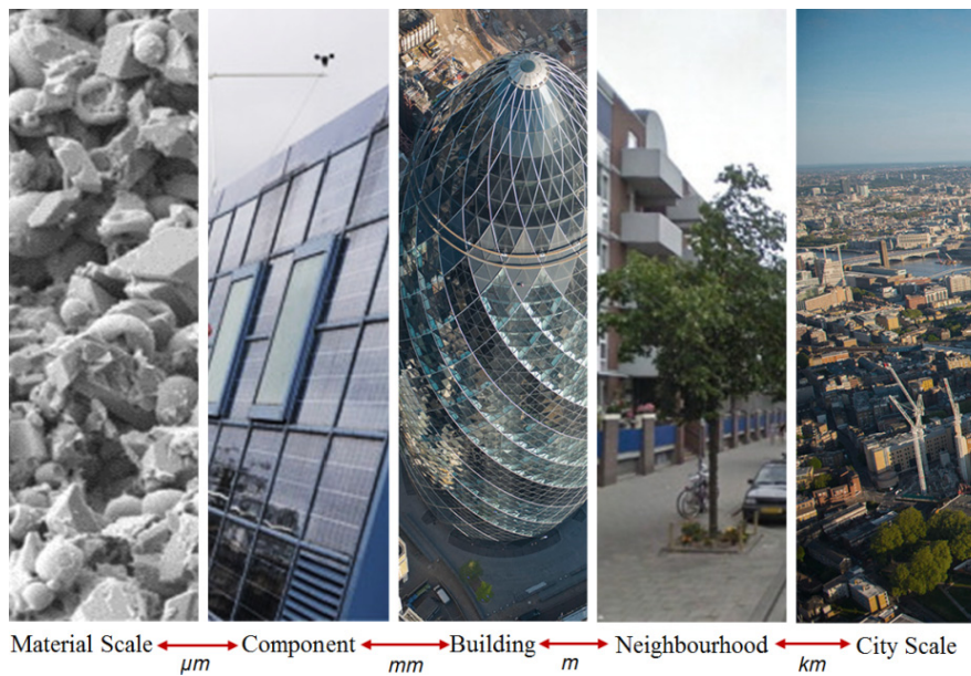
Fig. 1. Multi-level building engineering [11–14].