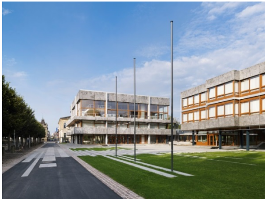
Figure 3. Federal Constitutional Court, Karlsruhe