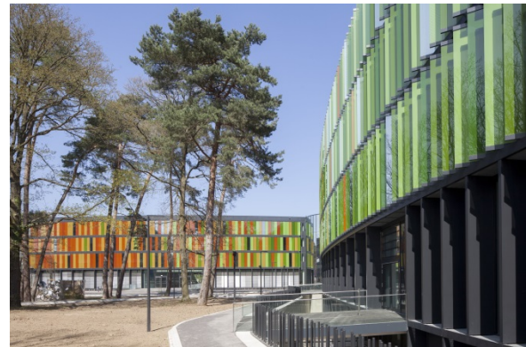
Figure 4. German Centre for Neurodegenerative Diseases, Bonn

The German Centre for Neurodegenerative Diseases (DZNE), the first laboratory building to receive BNB certification in gold, is currently being awarded. The new building is located on the campus of Bonn University Hospital and is not only equipped with state-of-the-art laboratories but is also operated in an environmentally friendly manner.