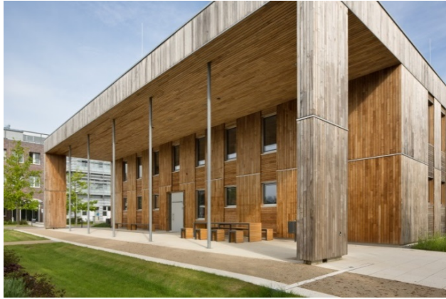
Figure 2. New Office building UBA 2019 in Berlin-Marienfelde

The "Administration Building Bismarckplatz", a project for the UBA in Berlin, aims to achieve the Gold Standard for outstanding modernizations.