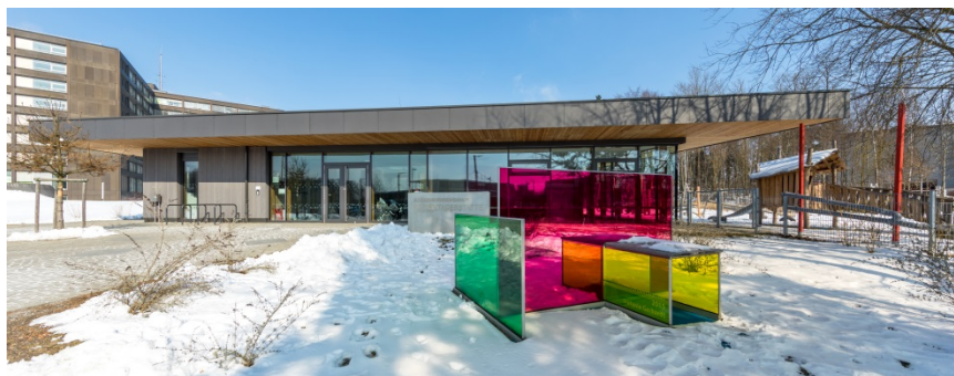
Figure 5. Daycare center at the Hospital of the German Armed Forces, Ulm (Martin Duckek)

The German Centre for Neurodegenerative Diseases (DZNE), the first laboratory building to receive BNB certification in gold, is currently being awarded. The new building is located on the campus of Bonn University Hospital and is not only equipped with state-of-the-art laboratories but is also operated in an environmentally friendly manner.