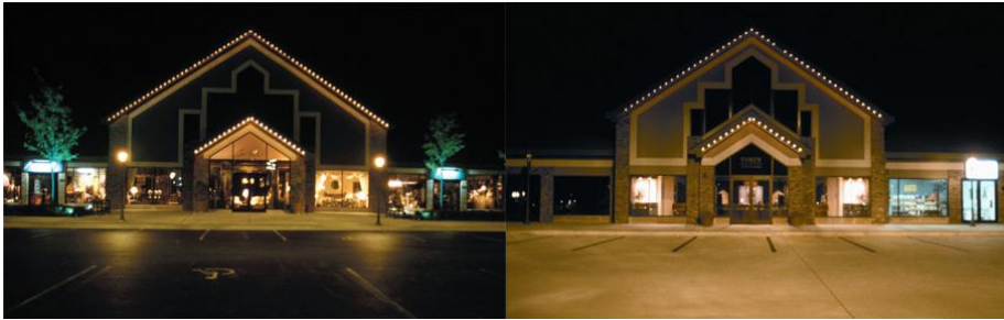
Figure 3. The difference in luminescence between asphalt and lighter colored concrete.

Using lighter colored surfaces can result in up to a 30% reduction in energy usage because reduced artificial lighting is required to achieve a similar brightness [13].